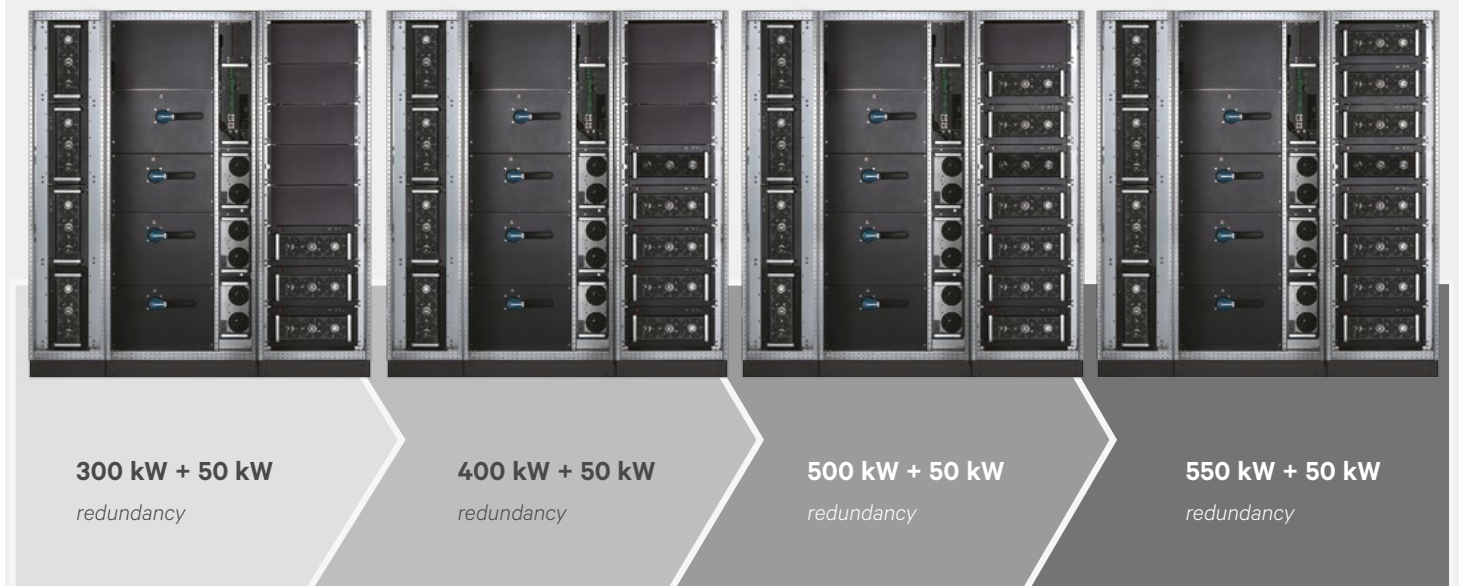
Liebert APM 50-600 kW