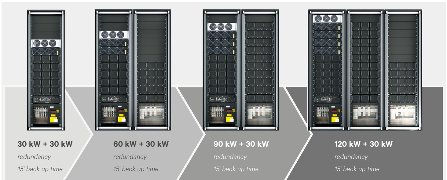
Liebert APM 30-150 kW